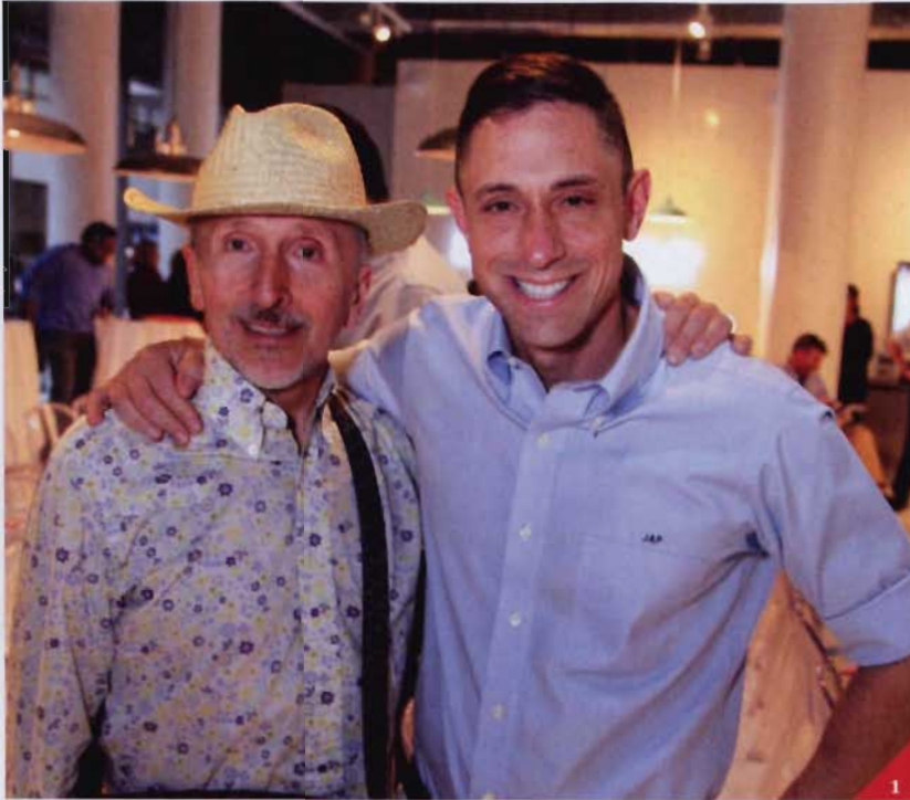
1 Creative ambassador-at-large for Barneys New York Simon Doonan and Designer Jonathan Adler at the #DellVenue.